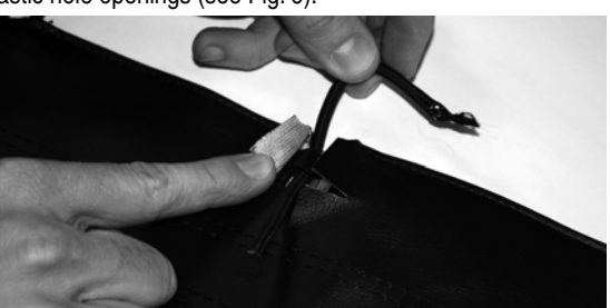
Figure 6 © Tie a knot in Bungee below the plastic hole (see Fig. 7).

⑤ Thread one end of the Bungee Loop Replacement down through one of the plastic hole openings (see Fig. 6).